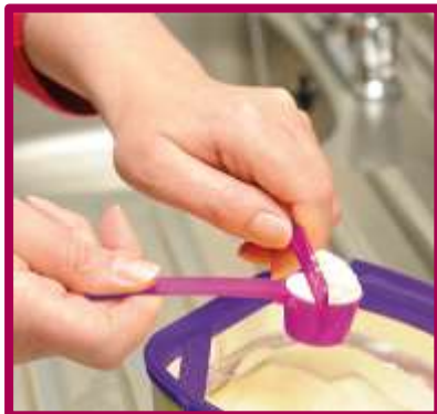
Formula milk powder, or sterile ready-to-feed liquid formula