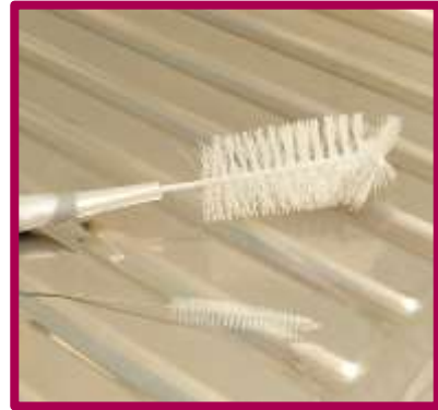
Bottle brush, teat brush