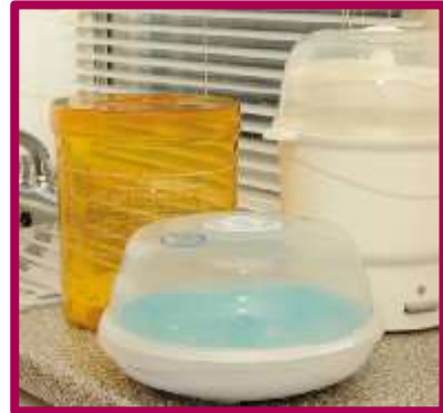
Sterilising equipment (such as a cold-water steriliser, microwave or steam steriliser)