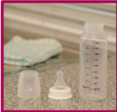
Bottles with teats and Bottle covers

You need to make sure you clean and sterilise the equipment to prevent your baby from getting infections and stomach upsets. You'll need: