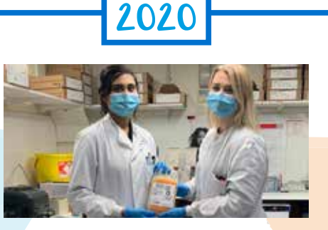
We respond to the COVID-19 pandemic, innovatively reorganising our services and helping to vaccinate both the public and our staff.