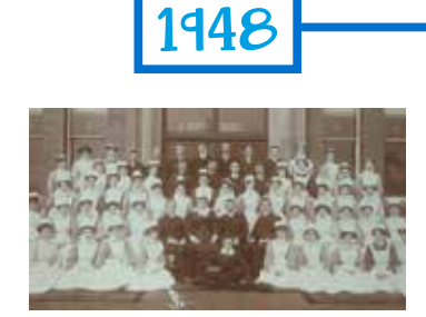
Stepping Hill Hospital, first opened in 1905, becomes part of the newly founded NHS.