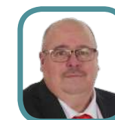
David McAllister (new governor)